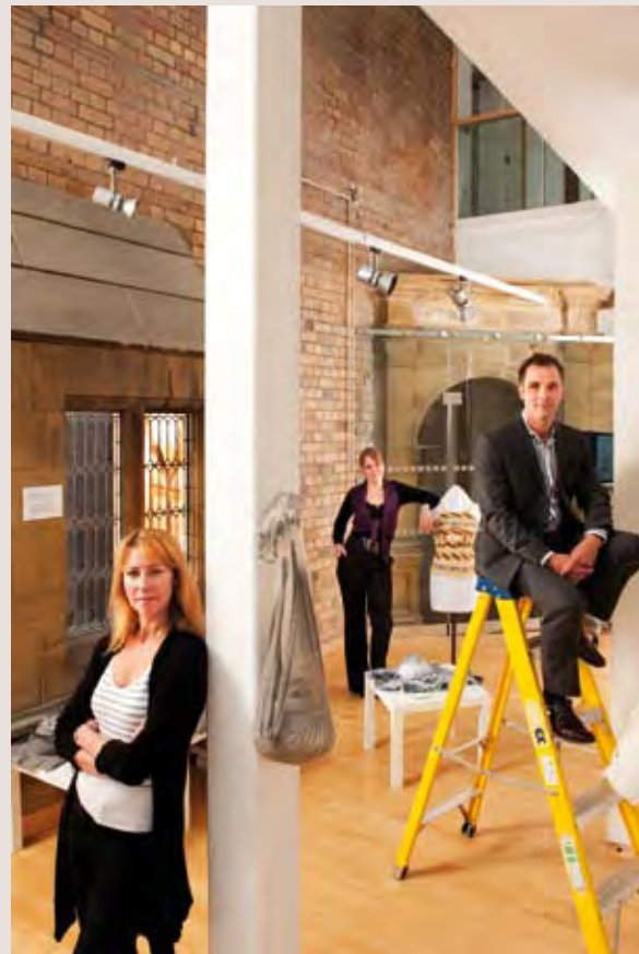
Woodend Creative Workspace, Scarborough

This centre for creative industries has been established in a grade II* listed building converted from a private residence. The property was gifted by the local authority on a 30-year lease to a new not-for-profit trust.