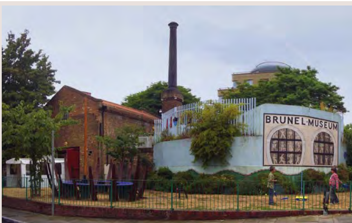
The Brunel Museum, London

A business plan should include information on expected overheads (including insurance, utility bills and management costs) as well as maintenance. The capacity to cover running costs may be critical. The Heritage Lottery Fund stresses the importance of understanding full cost recovery, so that organisations take proper account of their overheads (see Understanding Full Cost Recovery 60 , Heritage Lottery Fund). Some help on estimating running costs is available through the Association