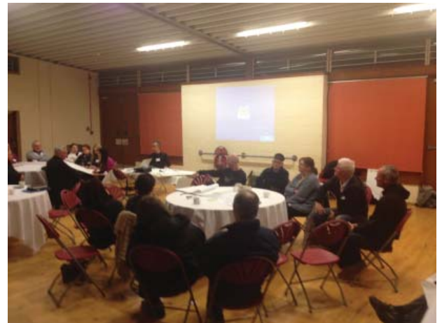
Participants at the roundtable event.