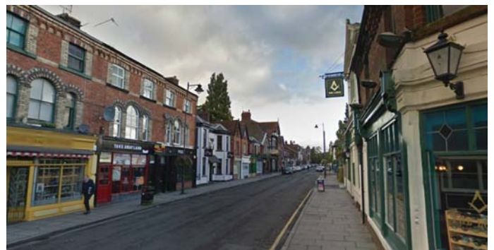
Lark Lane, Liverpool: A 'bohemian' high street with a good reputation, offering bars, cafes and restaurants. Some participants mentioned that they would like the high street in Garston to develop a night time economy.