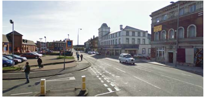
Walton Road, Kirkdale, Liverpool: A high street north of Liverpool City Centre offering a wide variety of independent shops and larger retailers.