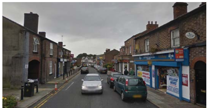
Allerton Road, Woolton Village, Liverpool: Located north east of Garston, the centre is a conservation area with a mix of restaurants, shops and housing. The area celebrates its historic buildings.