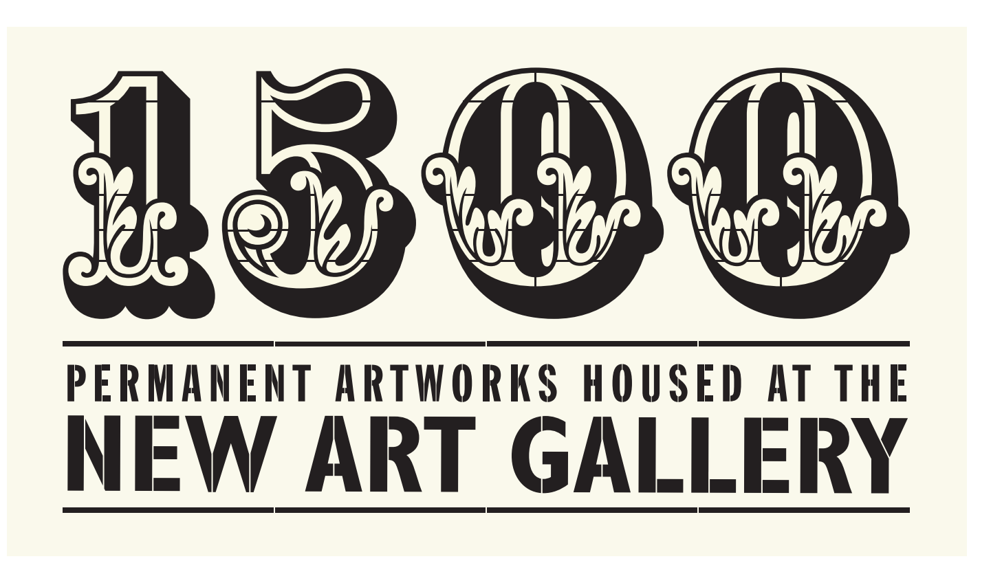
Artwork for Stencil No. 6 Liaising with local organisations allowed United Creatives to garner their set of positive facts.