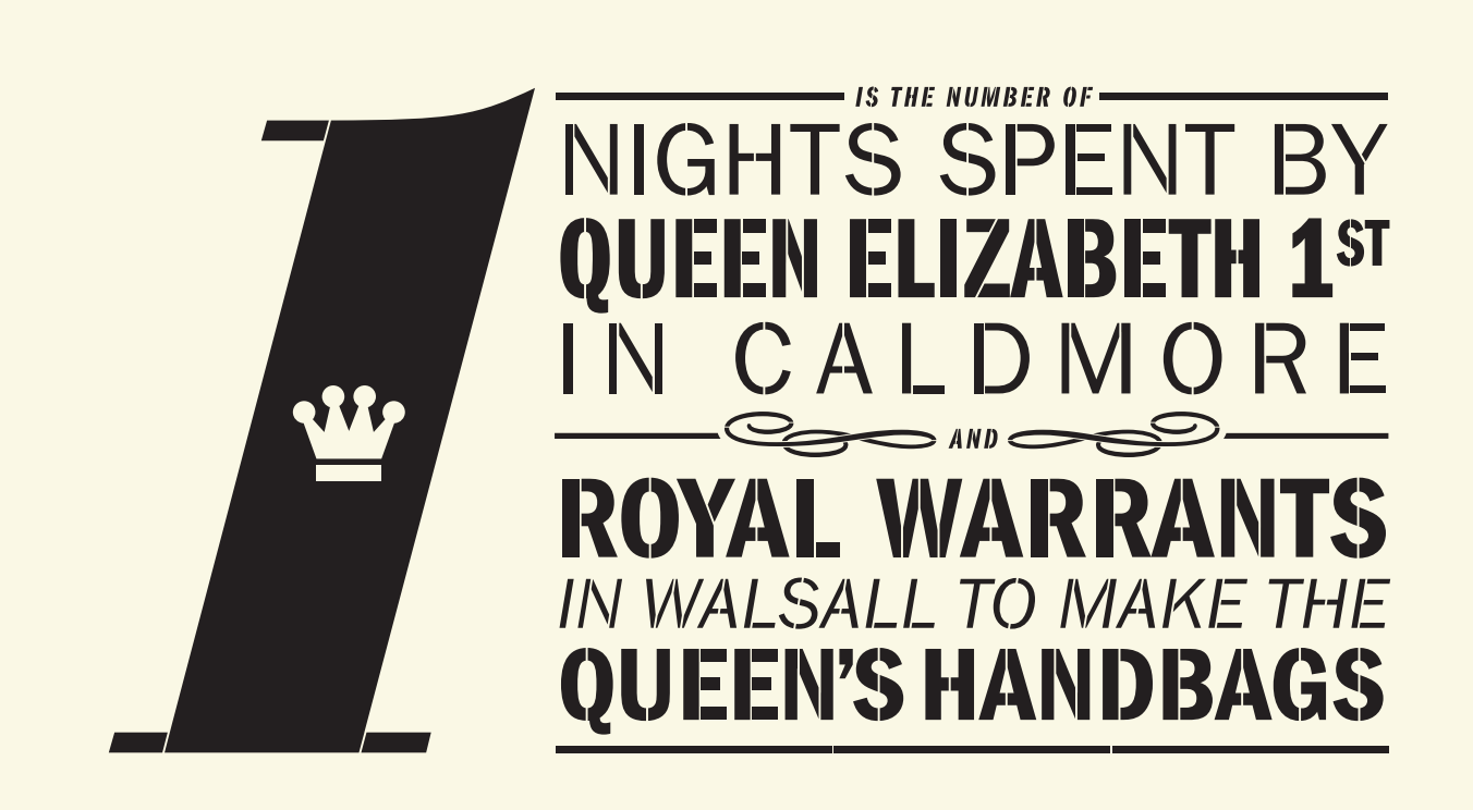
Artwork for Stencil No. 1 The first in a series of positive facts about Walsall town centre designed by United Creatives.