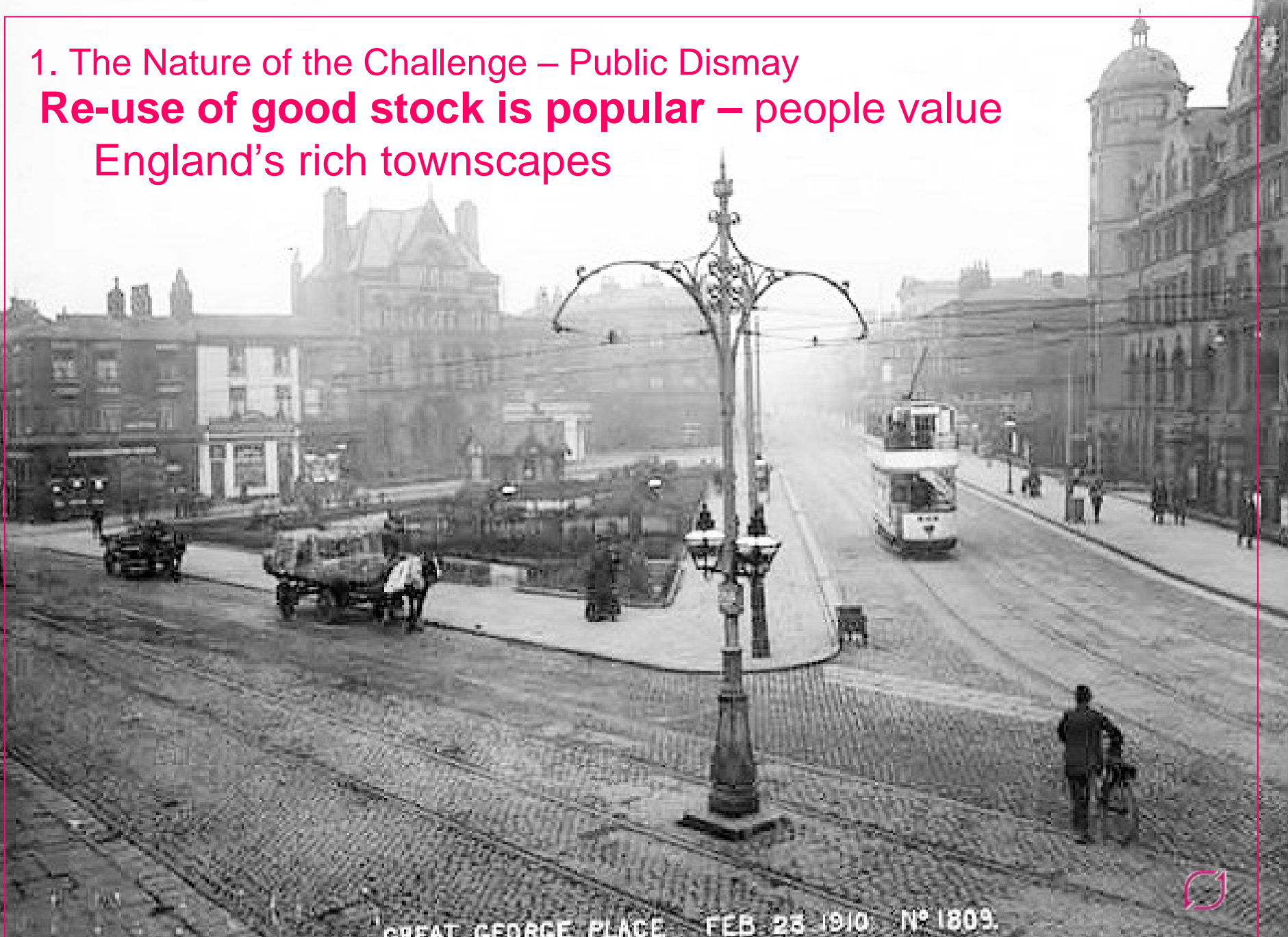
GREAT GEORGE PLACE FEB 23 1910 N° 1809.

Re-use of good stock is popular – people value England's rich townscapes