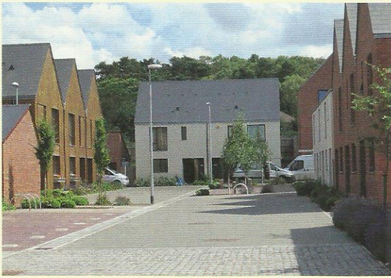
↑ Streets designed for the benefit of pedestrians and cyclists