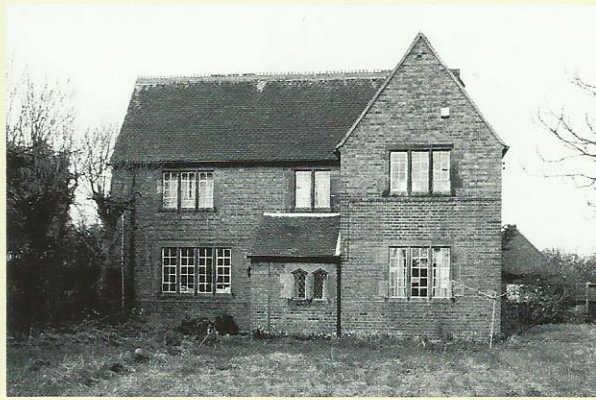
↗ An 1843 house designed by Pugin has not changed much in 170 years