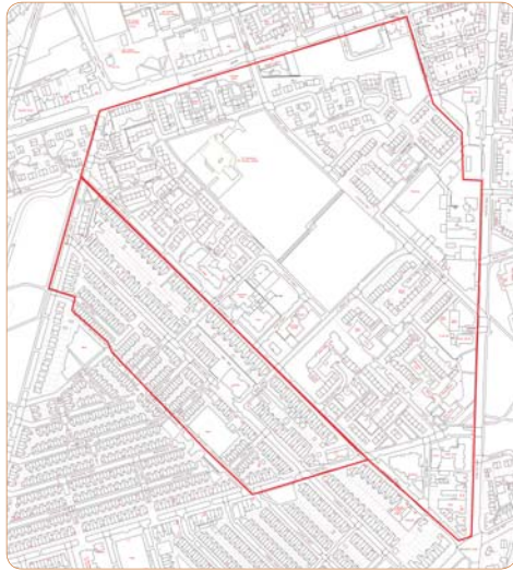
Old Trafford Central