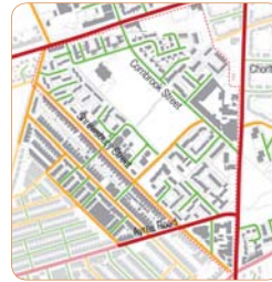
Open Space Plan