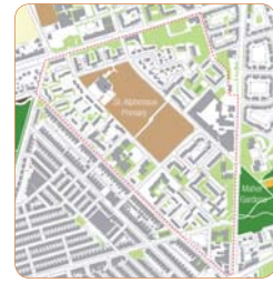
Road Hierarchy Plan