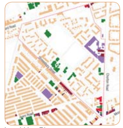
Land Use Plan

Old Trafford Central is the area between Stretford Road and Upper Chorlton Road including Hamilton Grove, Cornbrook Grove, School Walk, the Cliftons and the terraced area of housing between Shrewsbury Street and Prestage Street. This area would benefit from environmental improvements to roads and open space and infill housing on vacant sites.