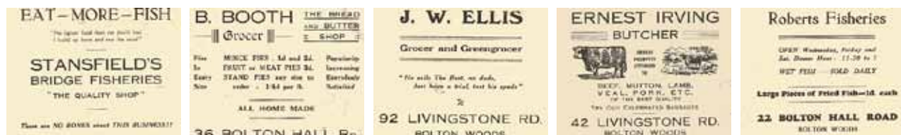
Local shops in Bolton Woods in the 1920's

It was once full of shops and in the 1920's was a large and thriving centre. It began to lose shops when Canal Road was cut along the valley bottom depriving it of its passing trade. Despite this decline in shops and facilities, it is a strong and close knit community that has retained its identity. This sense of identity is a strong foundation on which to build an attractive and improved neighbourhood together with the community.