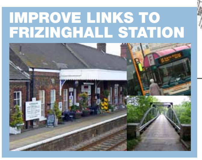
Improvements have been proposed to the Gaisby Road junction to aid pedestrian movement towards the train station.

We are working closely with Bolton Woods Junior Football Club to create a broader and better range of community sports facilities around the local centre.