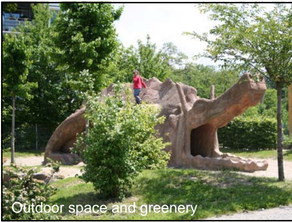
Outdoor space and greenery