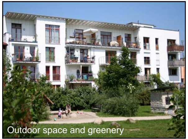
Outdoor space and greenery