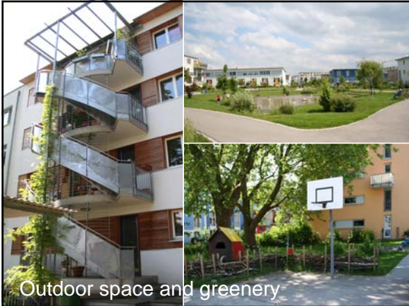
Outdoor space and greenery