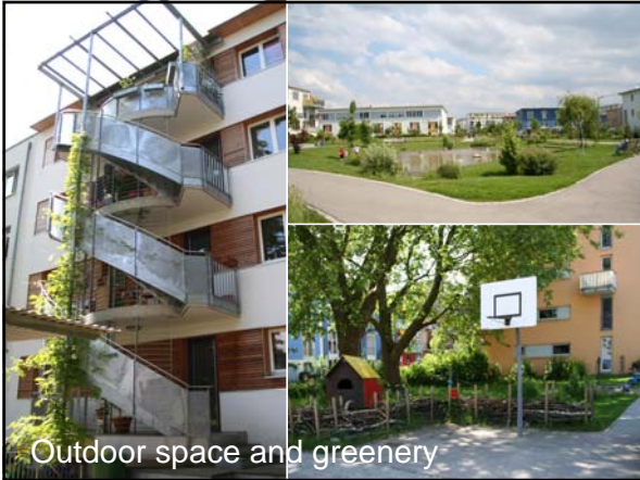
Outdoor space and greenery