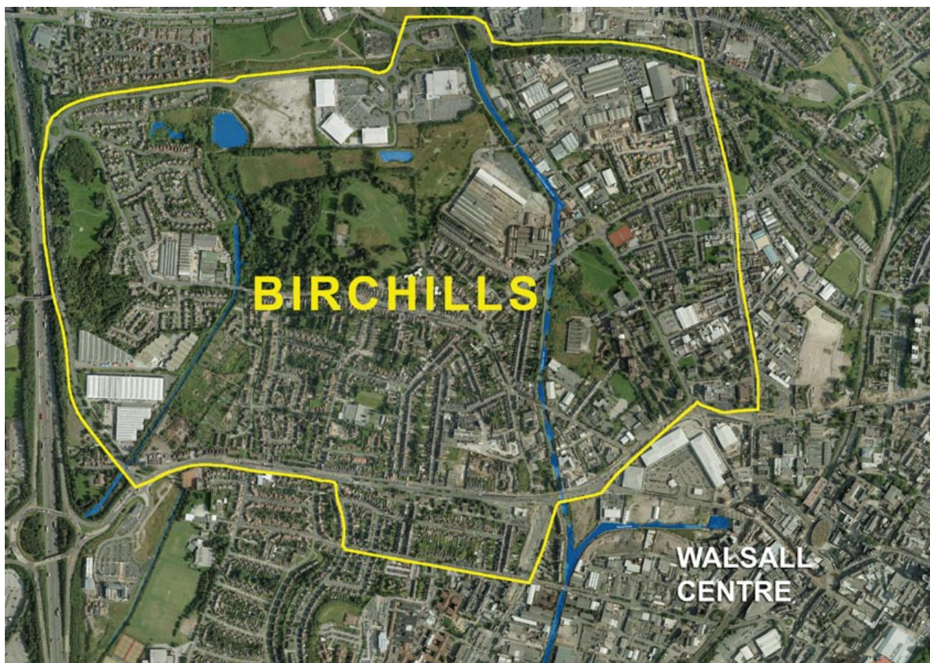
The SRF Study Area