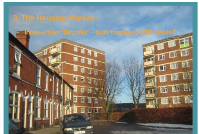
Slides from the evening's presentation