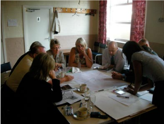
Table 3 discussions in motion