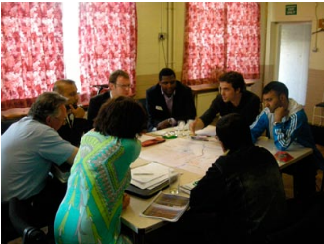
Table 2 in progress