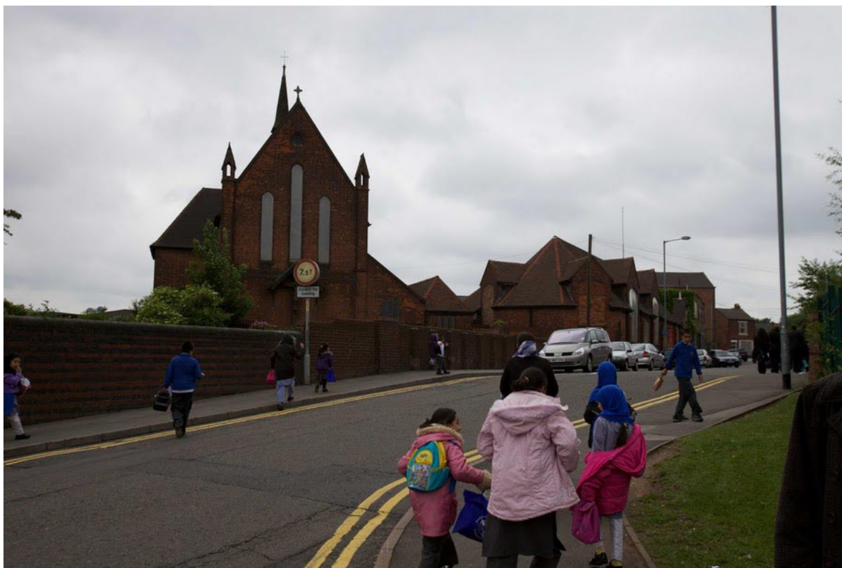
St. Andrew's church