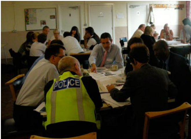
Table 1 at work