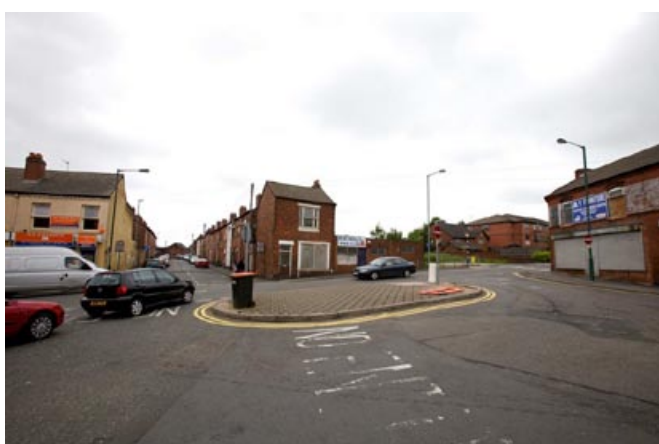
Birchills junction/local centre