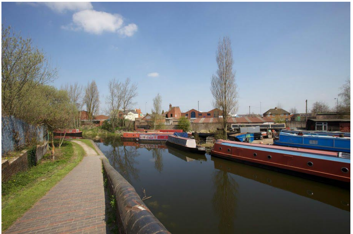
Canal towpath and working boat yard