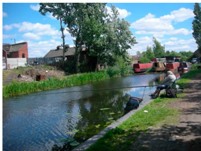
A gentleman fishing on the canal in Birchills