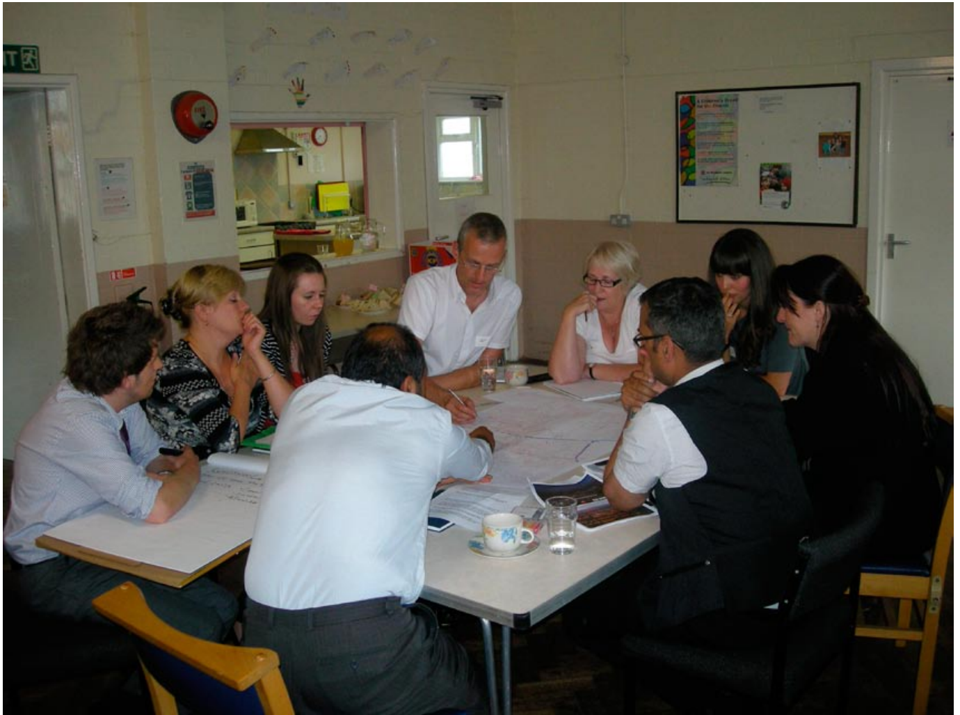
Table 4 mapping issues