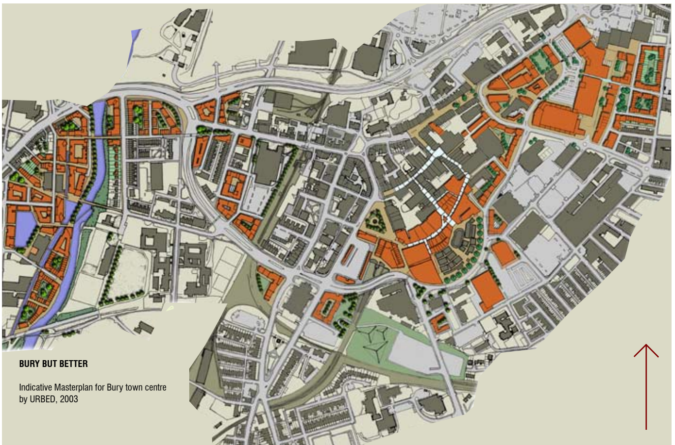
BURY BUT BETTER

Facing page: Work on the former Arts & Crafts Centre (April 2008); Below: Bury town centre masterplan (2003 Bury But Better study)