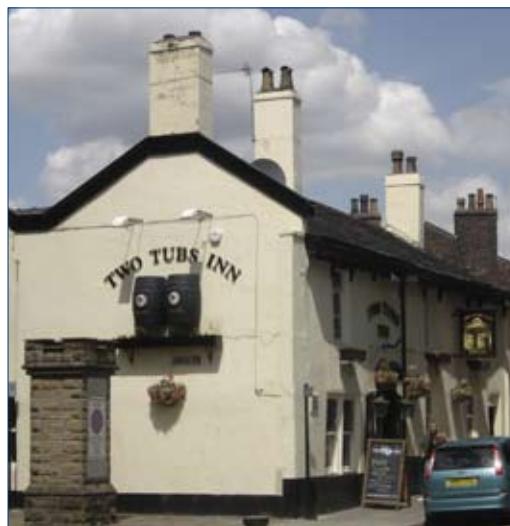
Facing page: Silver Street; This page: The Two Tubs Inn, Market Place

Both the Core Strategy and the Site Allocations documents will draw on the outcomes of this 'Bury but Better' masterplan report and its recommendations and proposals for each of Bury's town centre 'quarters'.