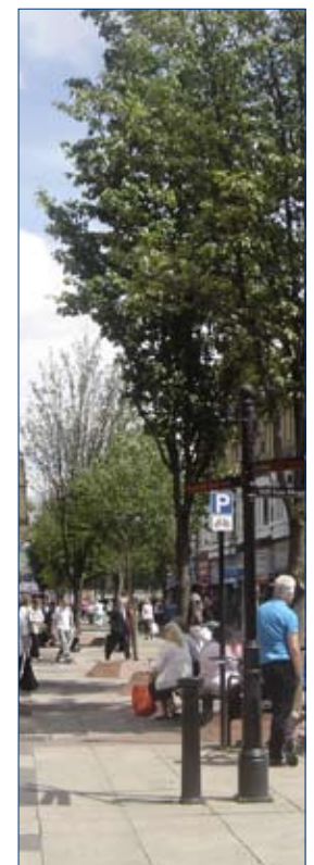
This page: left: The Square; below: The Rock