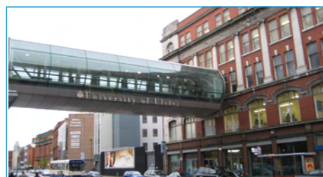
The University of Ulster's new Faculty of Art, Design and the Built Environment