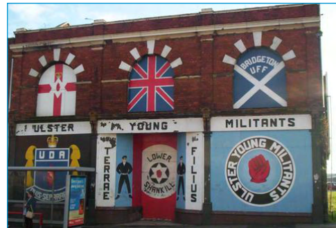
Shankill Road mural

Central Belfast 30 years ago looked like a war zone under military control. Buildings like the Europa Hotel where we stayed were repeatedly bombed. People who wanted to visit Belfast city centre had to go through a security cordon. Not surprisingly the main shops closed and moved out to follow where those with money to spend had gone. Education, not religious affiliation, became the key to getting a good job and the money to live on.