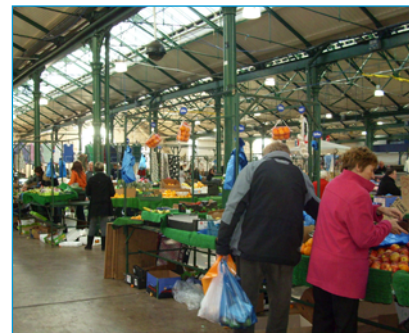
The thriving George Street Market