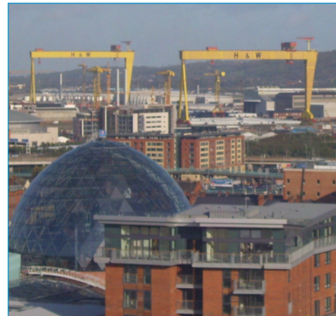
Belfast's skyline is still dominated today by Harland and Wolff's famous twin gantry cranes, Samson and Goliath, built in 1974 and 1969