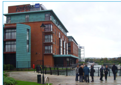
The Gasworks Quarter hosts a wide range of enterprises including a 132 Radisson SAS hotel, the Halifax Centre, shops, small enterprise workshops, own-door offices, purpose-built business units. Currently, some 2,500 people work there.