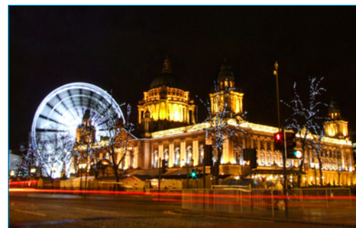
The Belfast Wheel and City Hall