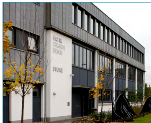
The Gasworks Quarter