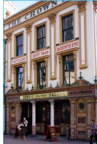
The Crown Inn acquired by the National Trust