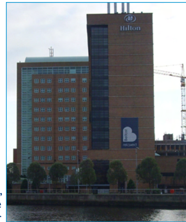
Hilton hotel, on the Lagan River

Despite the physical changes, the successes in opening up employment through recruitment and training programmes seemed disappointingly small. Great efforts had been made, once the building programme on Victoria Square was underway, to interest local people in training programmes in both dry-lining, where there was a skills shortage, and also retailing, where new jobs were being created. Many job fairs were put on, but they attracted mainly people who already had jobs. The truth was that leaving state benefits was not seen as worthwhile for the long term unemployed. A culture of dependence was hard to break. Community groups acted as advocates and critics, but did not, we were told, play an active part in making programmes work.