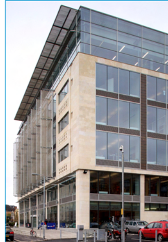
The Belfast campus of the University of Ulster on York Street is part of the city's vibrant Cathedral Quarter