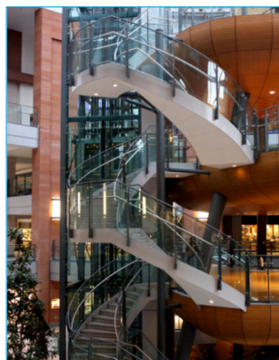
'Victoria Square has the wow factor'