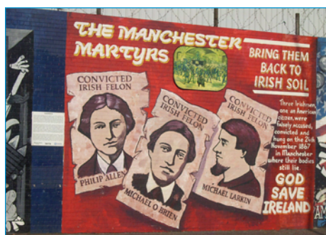
Mural's along the Falls Road

'The problem was not just about two communities – the gripe was with the British government'.