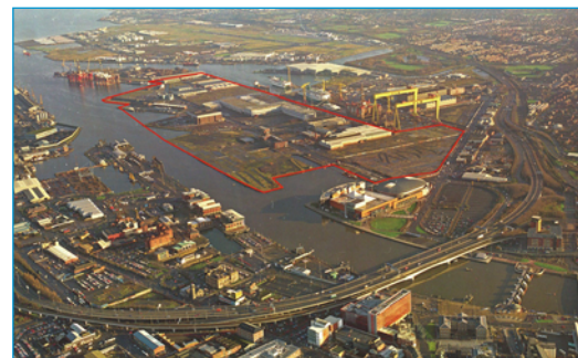
Aerial view of the Titanic Quarter