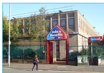
Jobs and Benefits centre in West Belfast

'We should invest more in keeping people moving up the ladder from no skills to some skills'