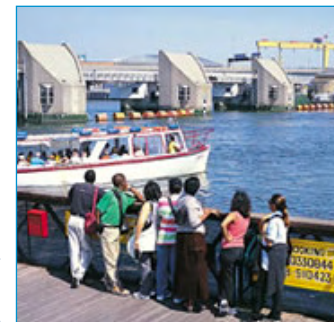
Right: Lagan Weir Below: Liganside development