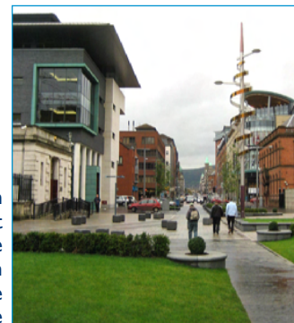
Public realm redevelopment linking the waterside with Victoria Square and the city centre