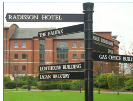
The Gasworks Quarter