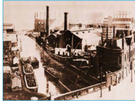
Work began on a gas making industry in 1822 on a site near Cromac dock, on ground owned by the Marquis of Donegall

The great breakthroughs came when the Blair government started to negotiate with the other side, (and violence largely stopped in 1992). The threat of takeover from the South was no longer so bad as feared, due to the enormous economic growth that the Republic of Ireland experienced after joining the European Union and subsequently the Euro Zone. Determined efforts to break down discrimination, for example by setting up the Northern Ireland Housing Executive, and the devolution of power to Northern Ireland, including faltering attempts to revive the parliament at Stormont, and local government, must have helped remove some of the sense of injustice. Local government has also started to make a comeback, having previously been responsible only for 'bins, bogs and burials' . The redevelopment of the Gasworks area provided its first chance to be seen to be doing something tangible and helped to rebuild the role of the local authorities and unite the politicians behind delivering something.