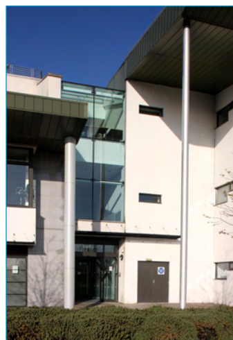
The Millennium Outreach Centre Springfield Road

The seven recommendations from the Task Forces, which included measures to promote new jobs and self-employment, were apparently largely disregarded, but the Employment Services Board was set up to