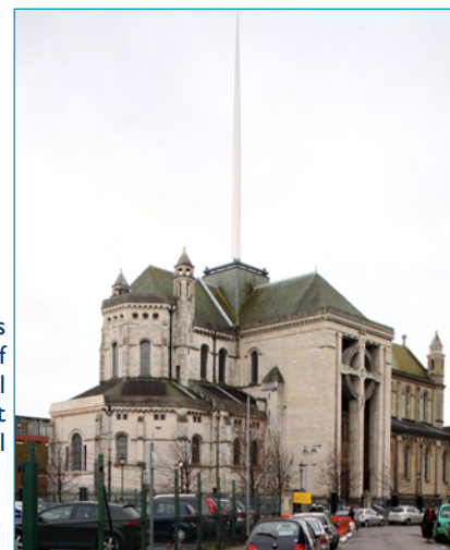
A new gallery is being built as part of Belfast's Cathedral Quarter next to St Anne's Cathedral

'There is not much to do when it starts to rain'