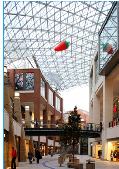
Victoria Square shopping centre

c. Break down walls The Peace Line symbolises the divide, but just as important are the mental barriers to entering the labour market. Local centres that focus on each individual's needs produce better