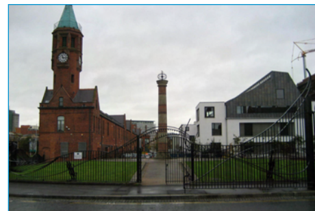
Quality conservation and reuse of buildings along side attractive new offices in the Gasworks Quarter